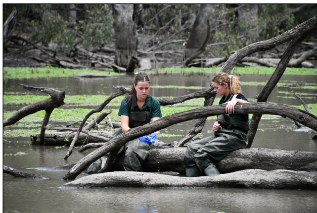
Photo: Students collecting eDNA samples